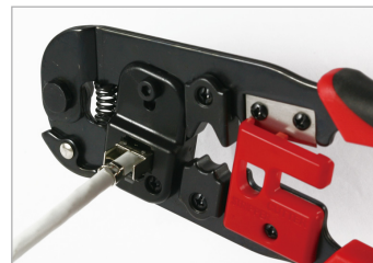
Crimping RJ45 plug